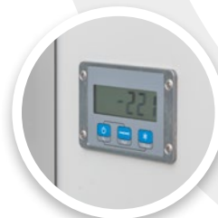
Digital display of drilling depth