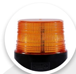
LED warning light