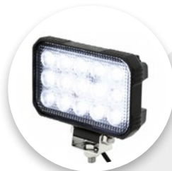
LED work light