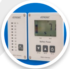
LCD display for water level and battery level