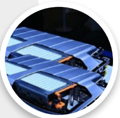
Min. 6 hours running time